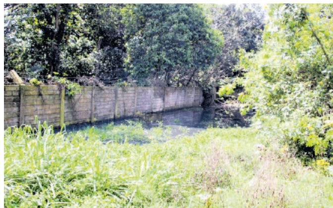
Raw sewage causes a stink alongside people's homes