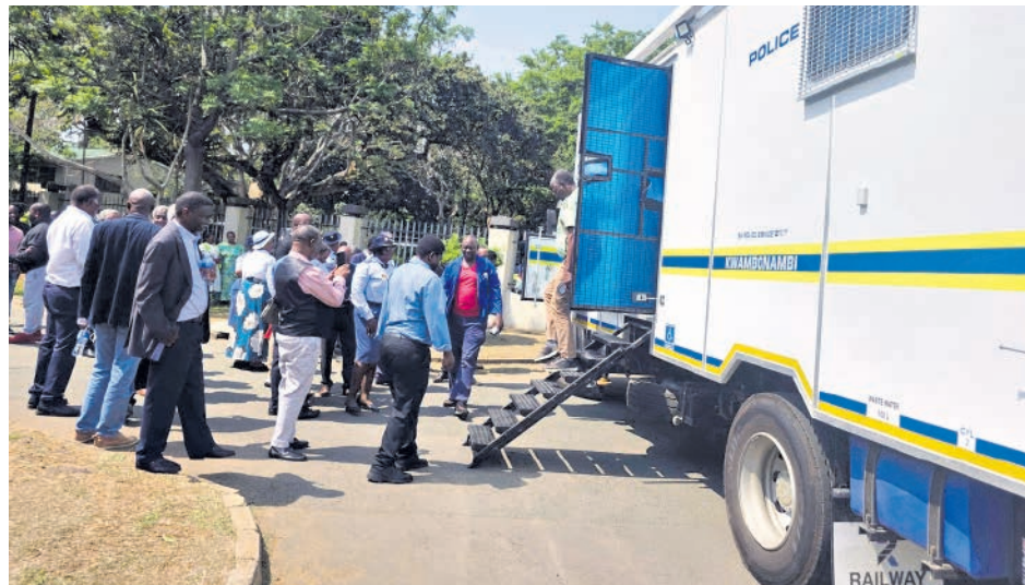
The mobile police station is expected to criss-cross uMfolozi Municipality

Acting district commissioner for King Cetshwayo, Brigadier Mandla Mhlongo said this initiative originated from community dissatisfaction about service shortcomings, including the absence of a police station in rural areas.