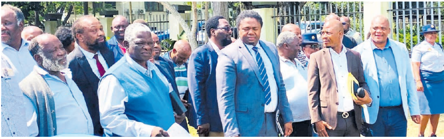
AmaKhosi in uMfolozi Municipality welcome the mobile police station to fight crime in their communities