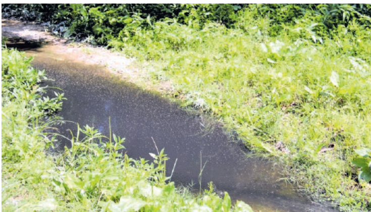
The raw sewage is contaminating lake Mzingazi and the canal

Mthethwa further urged that appointed CPF members be introduced to all traditional authority councils within uMfolozi so as to be verified accordingly.