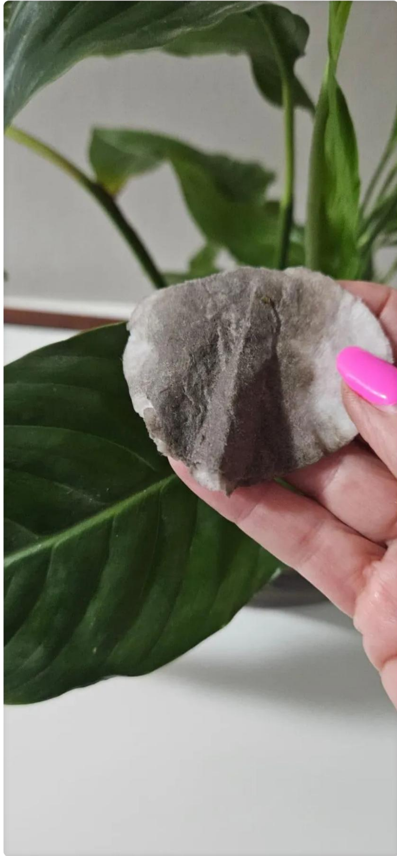
On indoor plants.