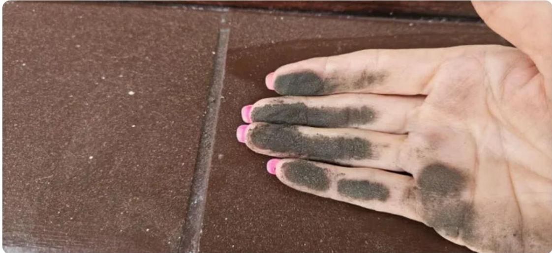
Coal dust on the ground.