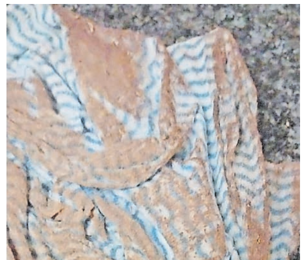
Wiping down of surfaces reveals thick red dust

“Tronox is committed to proactively monitoring weather conditions, and increases the frequency of its dust suppression efforts should predicted weather conditions indicate abnormalities.”