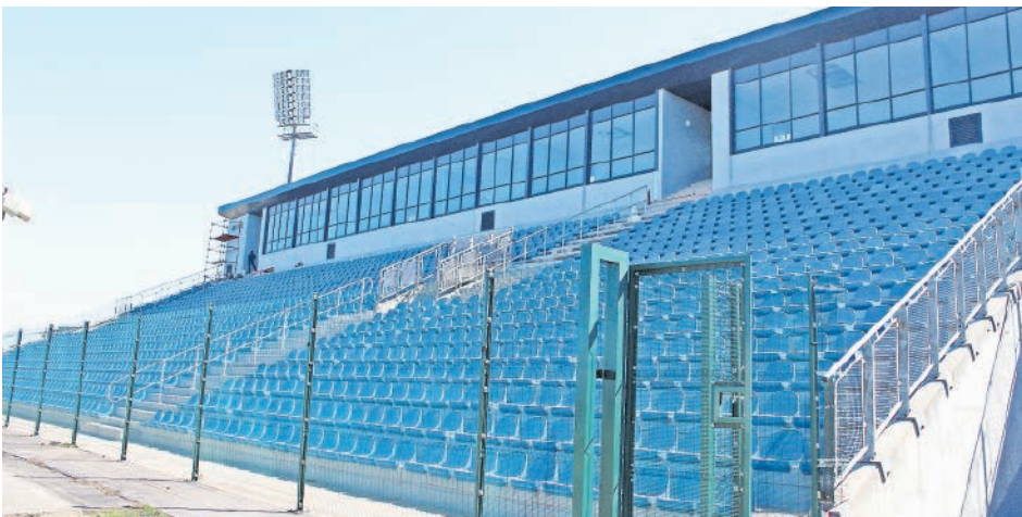
Almost all the electrical work has been finalised for the VIP suites on top of the main grandstand

A date will shortly be set for an inspection tour of the stadium by PSL officials, who will assess the readiness for matches to resume.