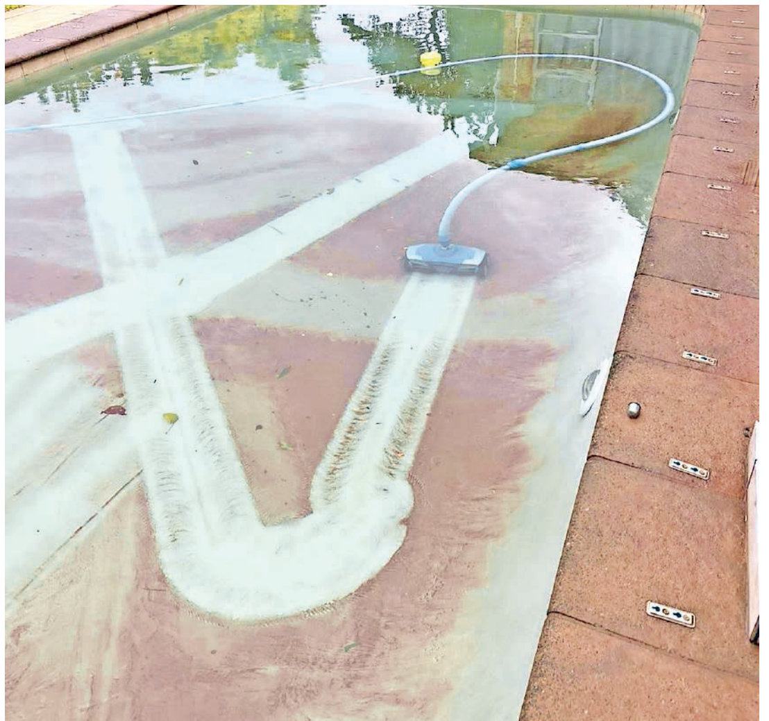
Red dust blankets surfaces and sinks to the bottom of swimming pools